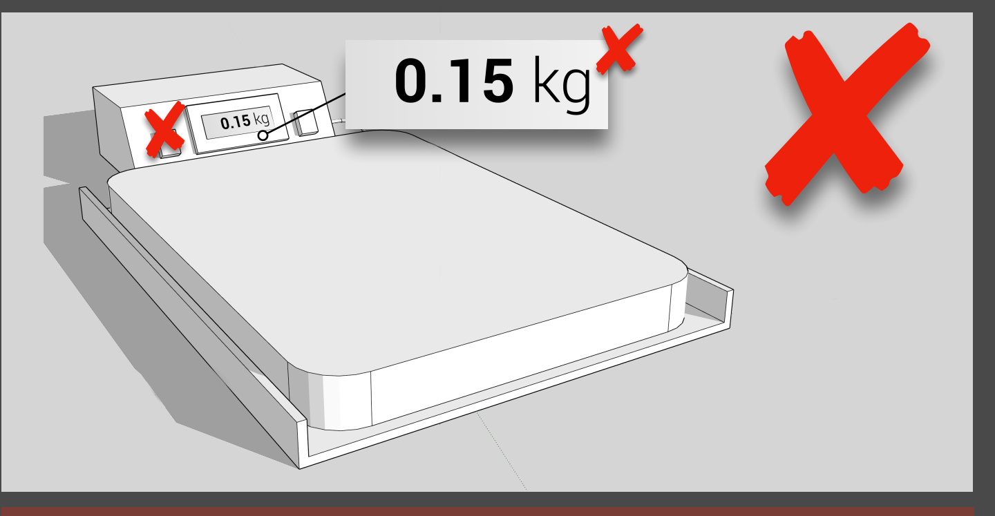
Avoid using Nett Weight, or incorrect units of measure, or uncalibrated scales

Reminder: alterations to Trade Unit Dimensions or Weight (or TIxHI) must be clearly communicated to the Retailer and — where applicable — updated in GS1 NPC/CPC