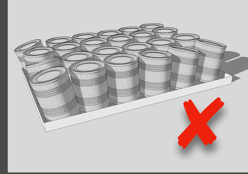
X Unsuitable, unsafe, unstable, unsealed