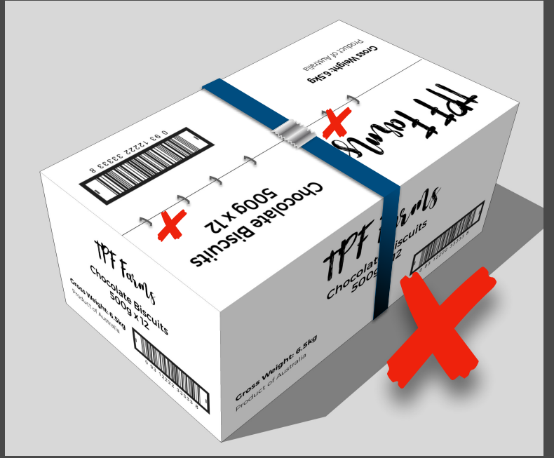
X Strapping, staples, metal clasps