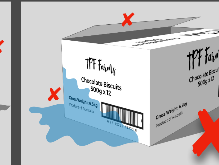
X Leaking, moisture-affected, open flaps