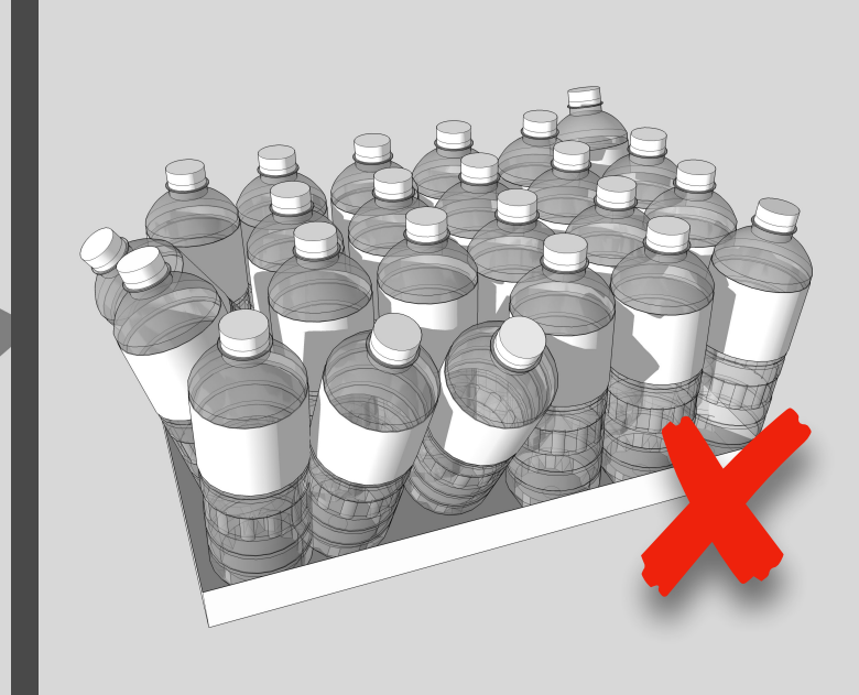
🗶 Unsuitable, unsafe, unstable, unsealed