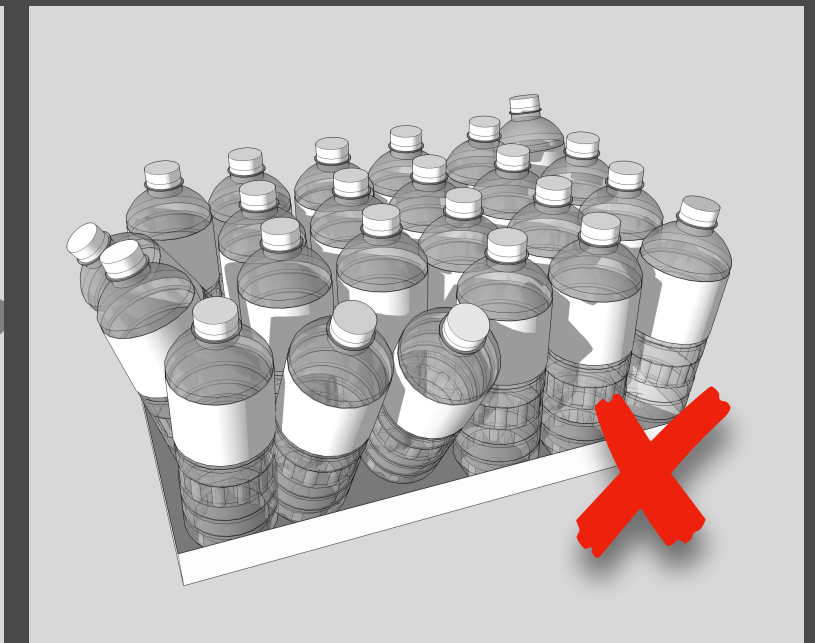
✗ Unsuitable, unsafe, unstable, unsealed