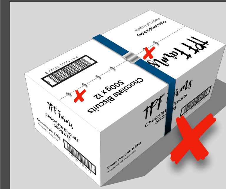
✗ Strapping, staples, metal clasps