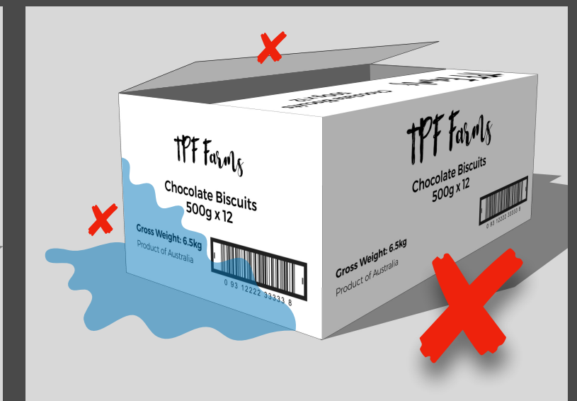
✗ Leaking, moisture-affected, open flaps