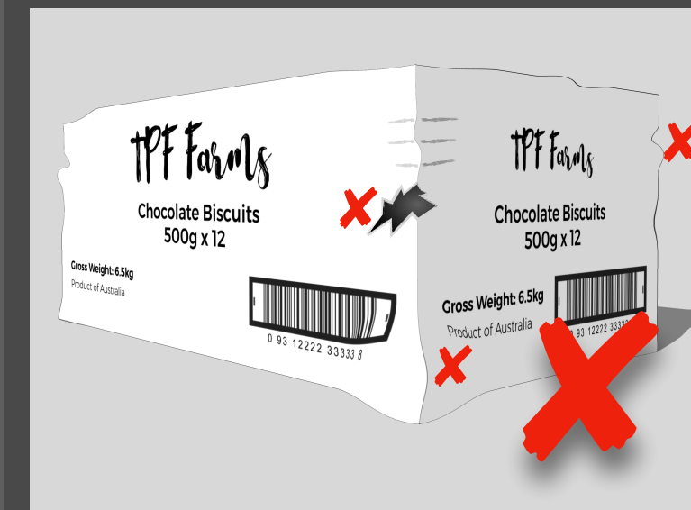
✗ Crushed, torn, unsanitary, unsaleable